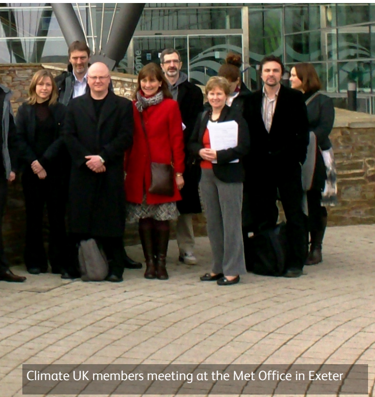
Climate UK members meeting at the Met Office in Exeter

Working with local authorities to manage climate risk and improve resilience is one of the central priorities of Climate South East (CSE). Despite increasing pressure to reduce costs, councils will still need to deliver on climate change priorities. For more than ten years, CSE has provided a forum in which council officers and outside experts can share experience and information about incorporating adaptation into planning, business and community engagement, and conserving biodiversity. To support councils in meeting the requirements of NI 188, CSE has organised and facilitated officers' and LSP workshops on climate risk assessment, provided evidence to Members' task groups, and given awareness-raising presentations at council-led events.