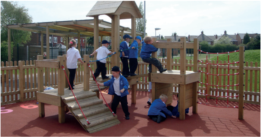
Pupils from Arnold Mill School, Nottingham

This photograph is taken from our short video case study about empa. Visit the EM IEP TV section of our website at: