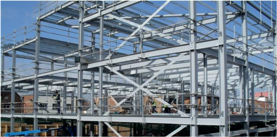
Red Lion construction in Spalding