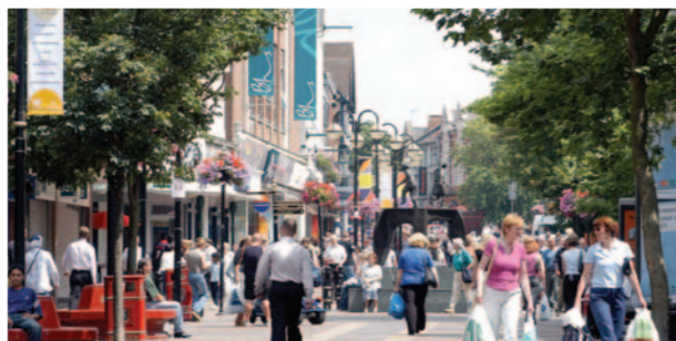
Northamptonshire Northampton town centre