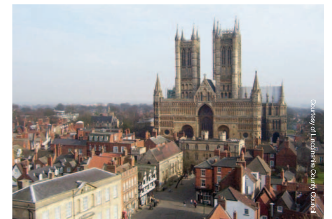
Lincolnshire Lincoln Cathedral

Overall, the prospectus aims to create: "Better outcomes for people and places – improvement through partnership."