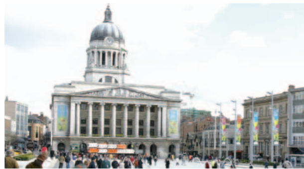
Nottinghamshire Old Market Square, Nottingham

For more information, visit the East Midlands IEP website.