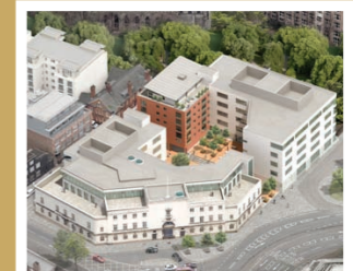
Leicestershire Colton Square, Leicester

The first East Midlands IEP members board meeting was held in May 2008.