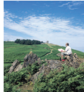
Leicestershire Bradgate Park, Charnwood Forest