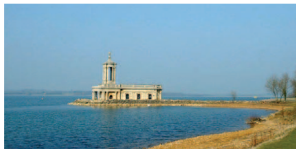
Rutland Rutland Water

tel: 0115 977 4921 web: www.eastmidlandsiep.gov.uk