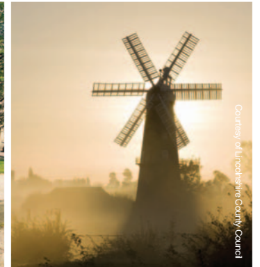
Lincolnshire Sibsey Trader Mill, Boston