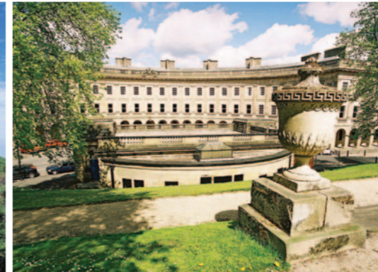
Derbyshire The Crescent, Buxton