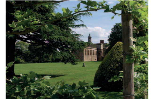
Nottinghamshire Rufford Abbey

The officer board is strengthened by advisors from the East Midlands Regional Assembly, Government Office for the East Midlands, the Improvement and Development Agency for local government, the Audit Commission and staff from the East Midlands IEP support team.