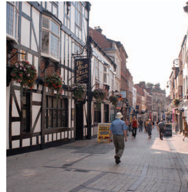
Derbyshire Sadler Gate, Derby

The board is supported by an officer group from county, unitary, district and borough councils, with officers coming from across the region.